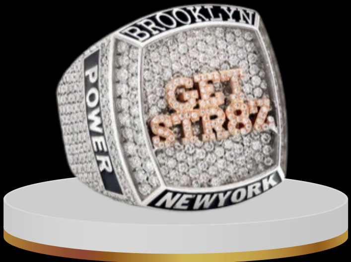
Brooklyn diamond ring